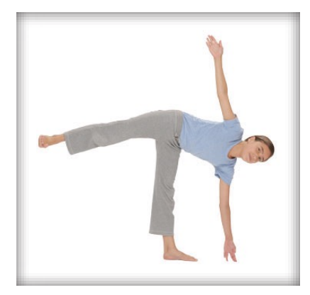
Inhale to enter Inhale-Exhale 2x