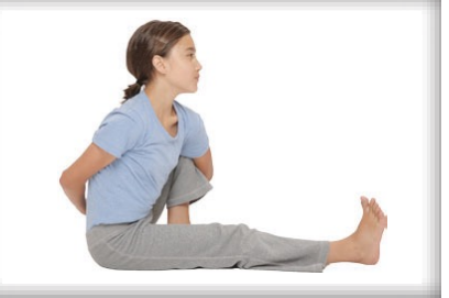
Exhale fold forward Inhale-Exhale 3x