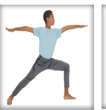
Exhale to enter Inhale-Exhale 2x Inhale