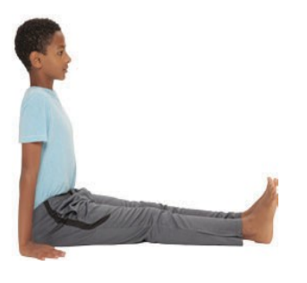
Inhale sit up