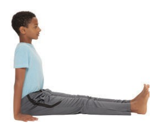
Inhale sit up