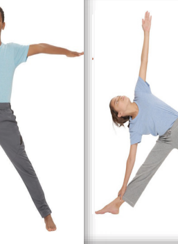
Exhale to enter Inhale-Exhale 3x