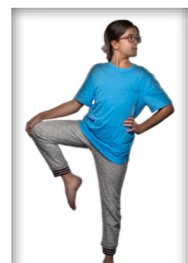
Exhale open leg out to side Inhale-Exhale 2-3x