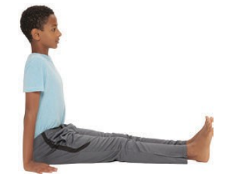
Inhale sit up, Exhale