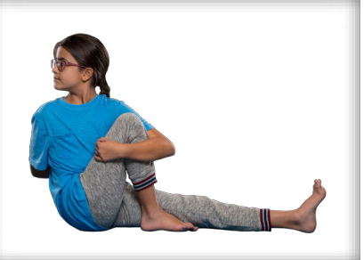
Exhale twist to the right Inhale-Exhale 3x