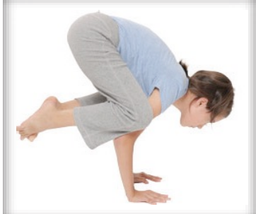
Inhale to enter Inhale-Exhale 3x