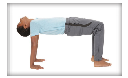
Inhale lift up Inhale-Exhale 3x