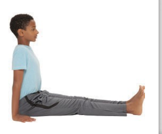
Inhale sit up