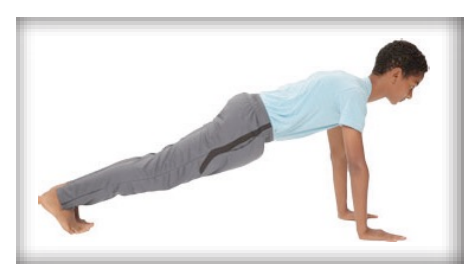
Exhale to enter Inhale-Exhale 3-5x