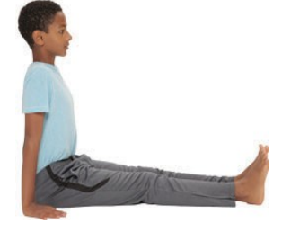
Inhale sit up, Exhale